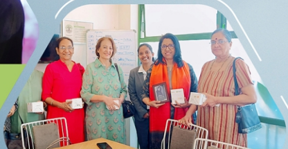
Melodious Bollywood Singer Kavita Krishnamurthy with her friends celebrating the tunes of mother nature at Touchwood Bliss