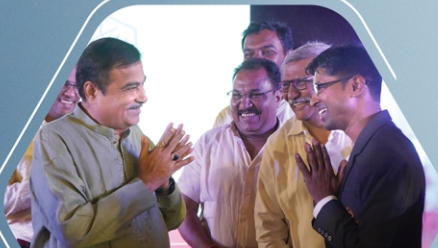
Shri. Nitin Gadkariji – One of India's most loved leader & Nature Lover, for a 2 day intimate family wedding